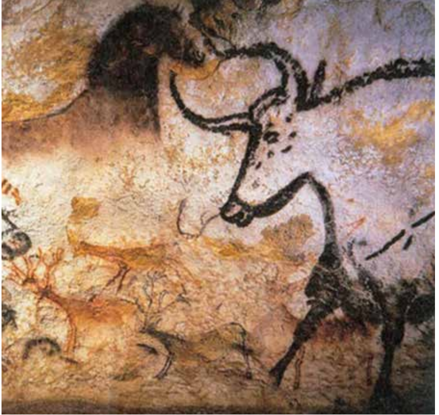
Lascaux Caves (Hall of the Bulls detail)