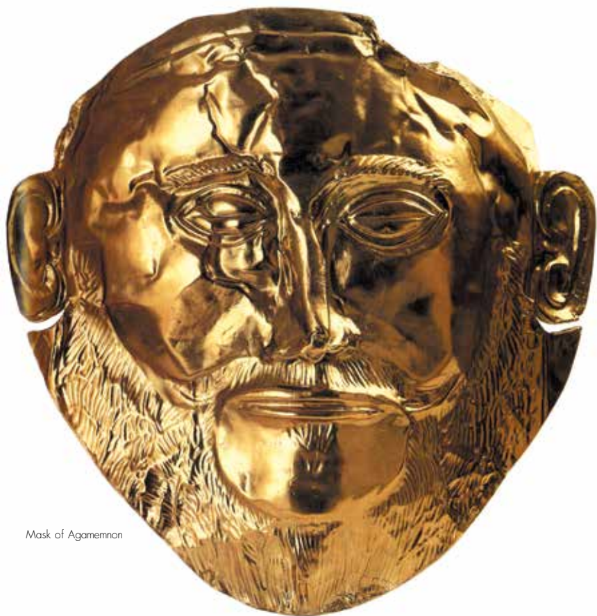
Mask of Agamemnon