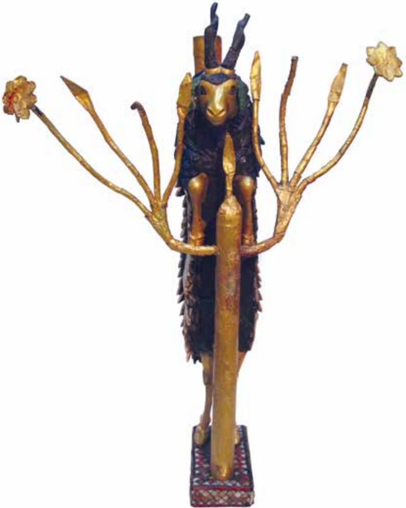
Ram in a Thicket