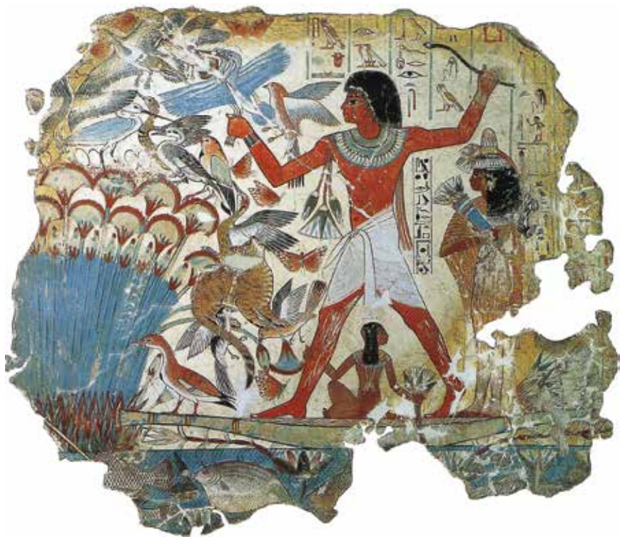
Fowling Scene from the Tomb of Nebamun