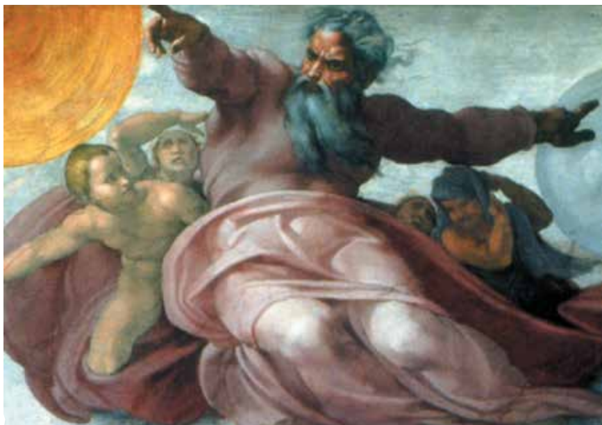
Creation of the Sun and Moon Sistine Chapel Ceiling