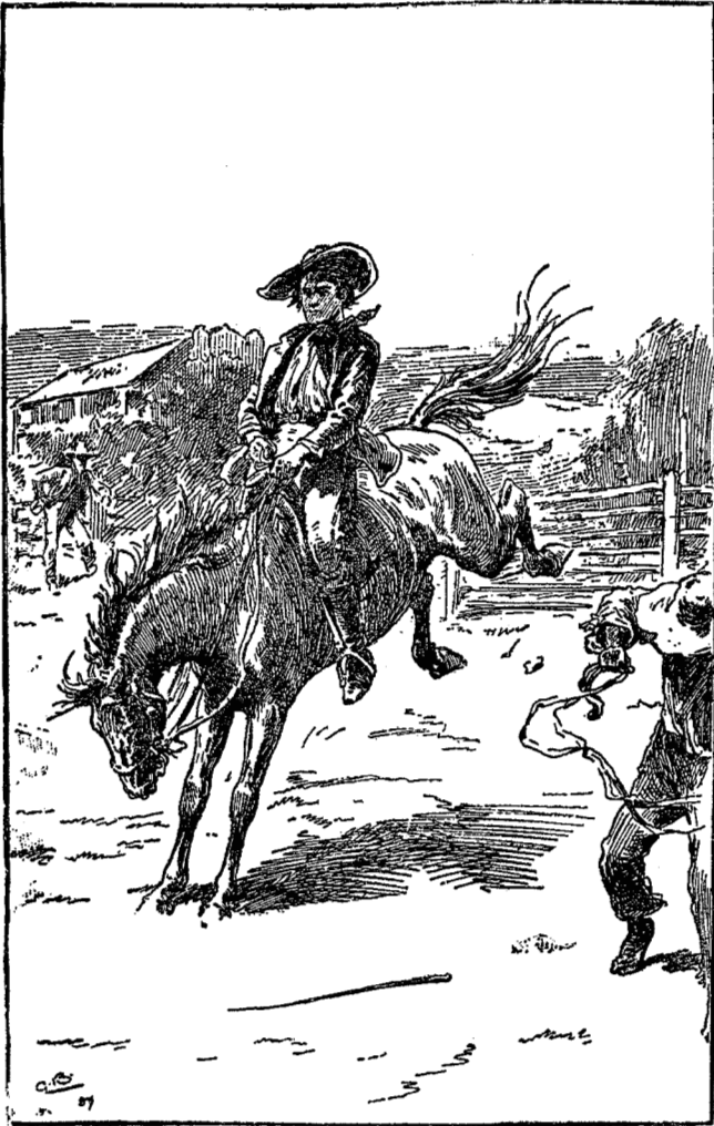
THE FIRST TRIAL OF WILDFIRE [FRONTISPIECE] SEE PAGE 9.